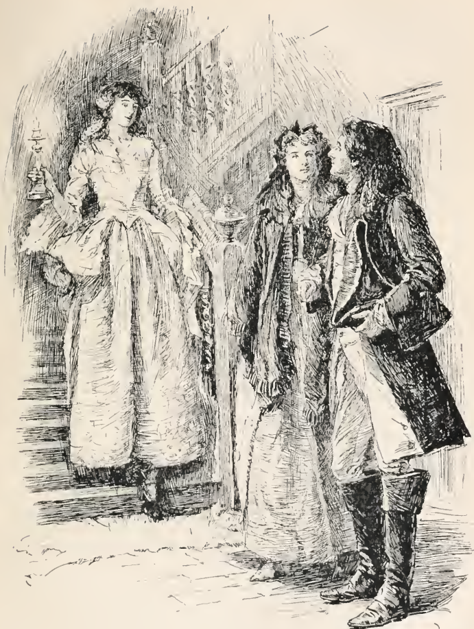
"She approached, shining smiles upon Esmond"